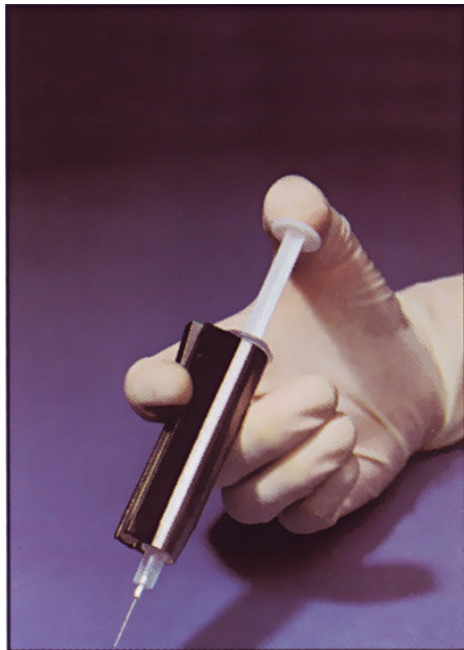
Safe-T-Lock design quickly engages or releases syringe.